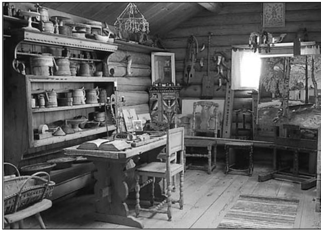
Gustaf Ankarcrona's studio (no. 8)