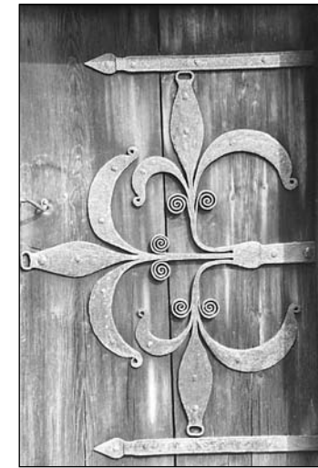
Fittings on the cellar door (no. 6), style copied from Gattugården in Ullvi.