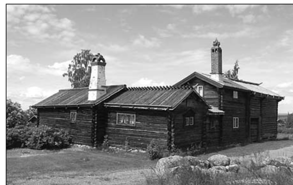
Enclosed farmyard; from left: double store-houses (no. 8), cellar house (no. 1), and loft-store (no. 2).