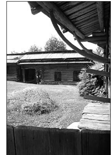
Farmyard, with the thresh barn in the foreground (no. 3) and the stable (no. 5).

7. Milking shed dating from 1827. The shed was brought from Halvarsgården in Laknäs and Gansåsens fäbodar.